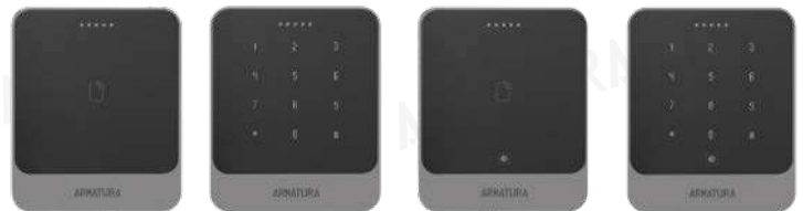
EP20C EP20CK EP20CQ EP20CKQ