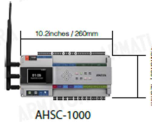
Dimensions of Core Controller