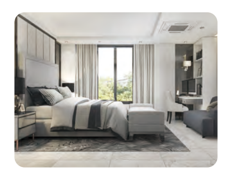
Short-term Rental Units