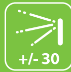
Wide Pose Angle Acceptance