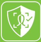
New Height of Anti-Spoofing