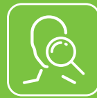
Touchless for Better Hygiene