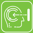
Proactive Facial Recognition